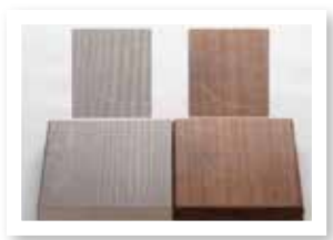
Clubhouse Brazilian Hardwood

Clubhouse Decking rivals the performance of the hardest woods available.