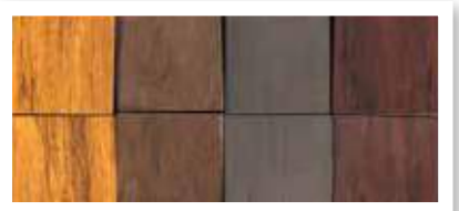
Ipe Walnut Ironwood Mahogany