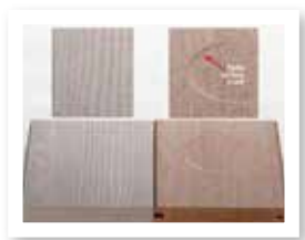
Clubhouse Competitive Cellular PVC Decking

Want more reasons? Visit ClubhouseDecking.com